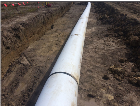
Butt welding of pipes in the field.