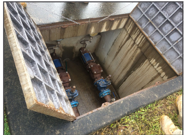
Valve chambers and associated flange fittings.

NSW—Office 12 Caribbean Street MOUNT COLAH NSW 2079