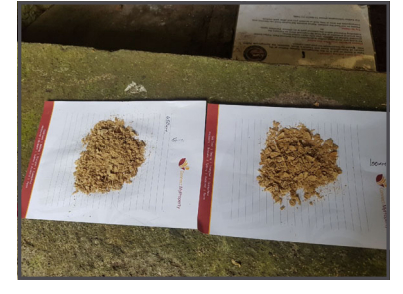
The left post was replaced and the other posts tested. Quality test samples from forensic investigation of the post timbers.